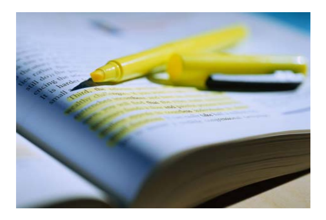
Board Meeting Highlights January 2, 2008 and February 6, 2008

New responsibilities were defined for the First Vice President and Second Vice President to help alleviate some of the workload of the President. The First Vice President will now be in charge of marketing and the marketing committee; a committee chair will be appointed if necessary. The Second Vice President will be responsible for notifying committee chairs of due dates for reports and seeing that the Committee Reports are distributed at the board meetings.